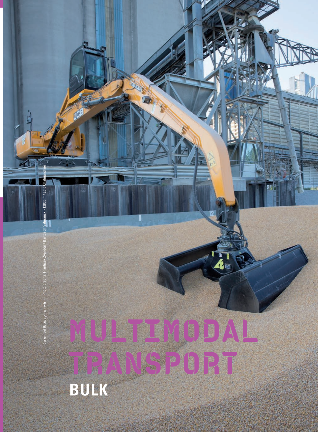
Design: Joli Rouge / y-jean-wfr.

RET Rhine Europe Terminals Sector D – 20 rue de Saint-Nazaire 67100 Strasbourg – France Phone: +33 (0)3 88 65 80 80 info@ret-strasbourg.com www.rhine-europe-terminals.com