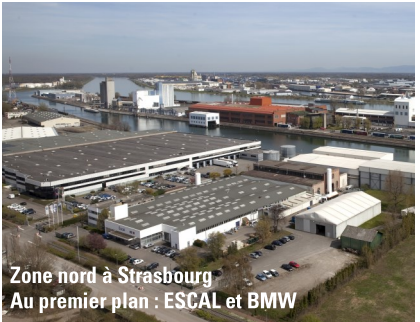
Zone nord à Strasbourg Au premier plan : ESCAL et BMW