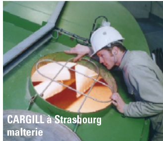
CARGILL à Strasbourg malerie