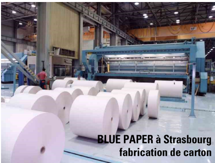
BLUE PAPER à Strasbourg fabrication de carton