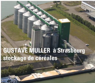
GUSTAVE MULLER à Strasbourg stockage de céréales