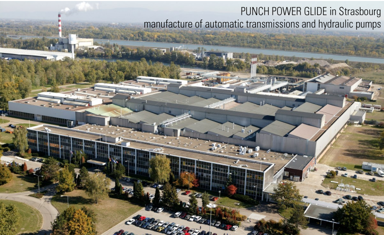
PUNCH POWER GLIDE in Strasbourg manufacture of automatic transmissions and hydraulic pumps

It is on the dynamism of local companies that the development of business parks, the source of jobs and wealth, is based. The diversity of the fabric of industries and services is an important balancing factor. The simultaneous presence of industry, logistics and transport combined sustains reciprocal developments and increases the capital gain for the regional economy.