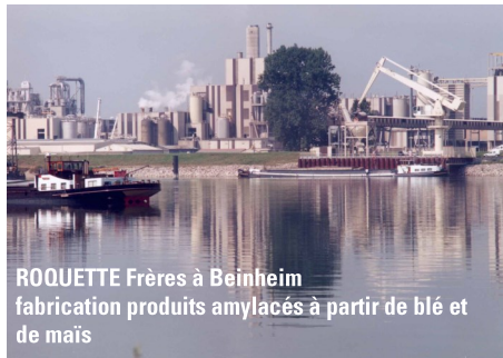
ROQUETTE Frères à Beinheim fabrication produits amylacés à partir de blé et de maïs