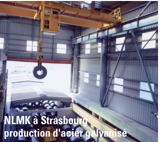
NLMK à Strasbourg production d'acier galvanisé