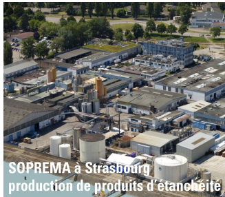
SOPREMA à Strasbourg production de produits d'étanchéité